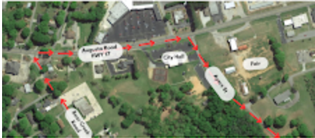
Parade Route.png 1567K