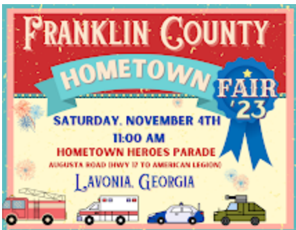
Parade Information.png 449K