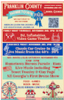
Fair Poster.jpg 1545K