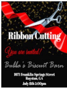
Ribbon Cutting.jpg 1840K