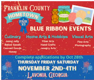
Blue Ribbon Contest.png 377K