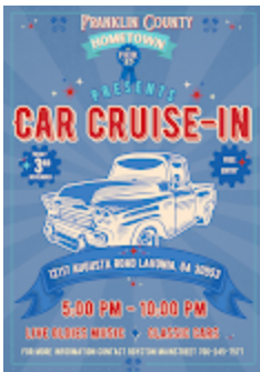
Car Cruise In.png 3050K