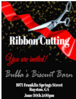
Ribbon Cutting.jpg 1467K