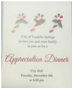
dinner invitation.jpg 591K